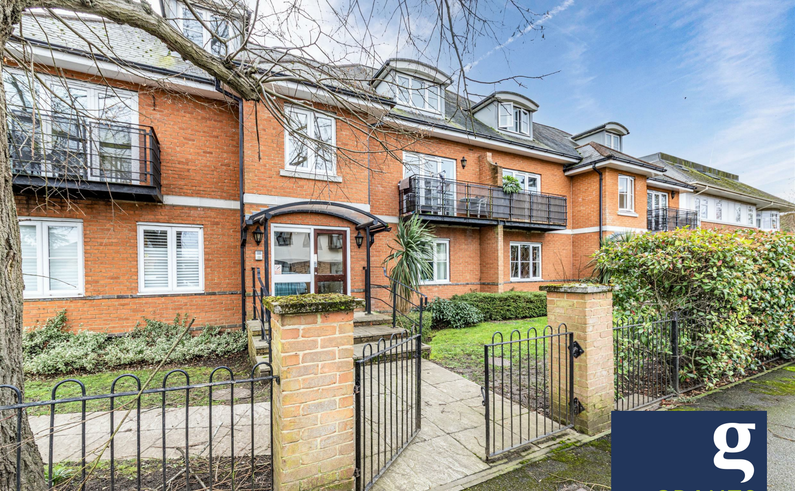
Pond House, Abbey Road, Chertsey, KT16 8AL